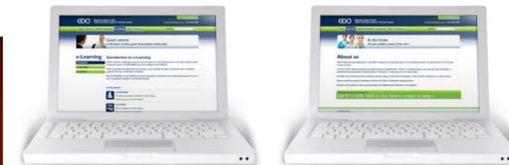
« Left / Advert design