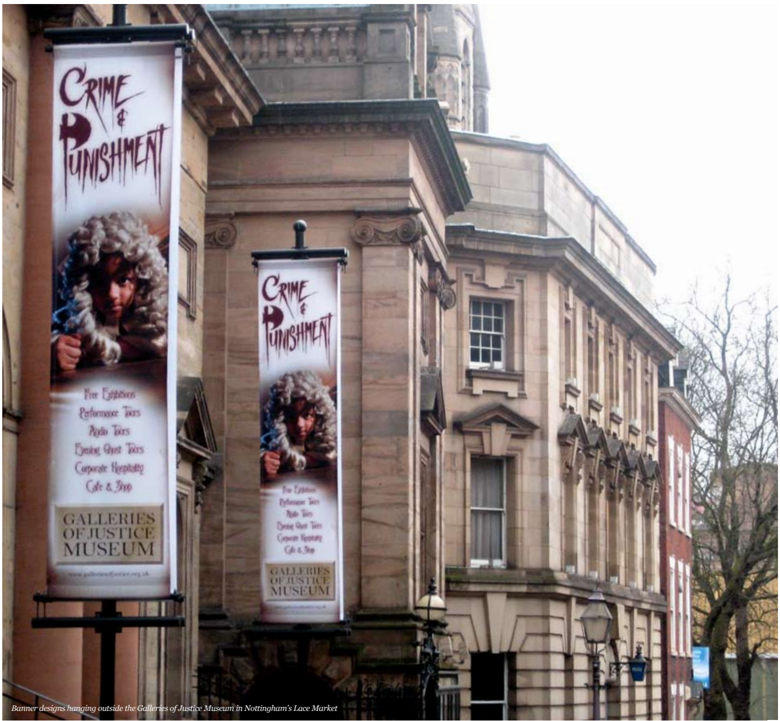
Banner designs hanging outside the Galleries of Justice Museum in Nottingham's Lace Market