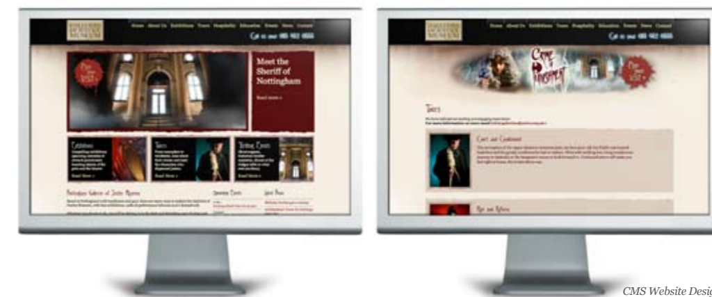
CMS Website Design