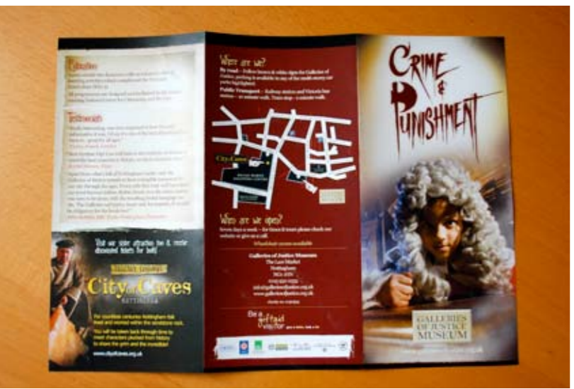
« Left / main attraction leaflet design