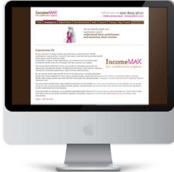
» Above / brand identity design » Below & right / website design