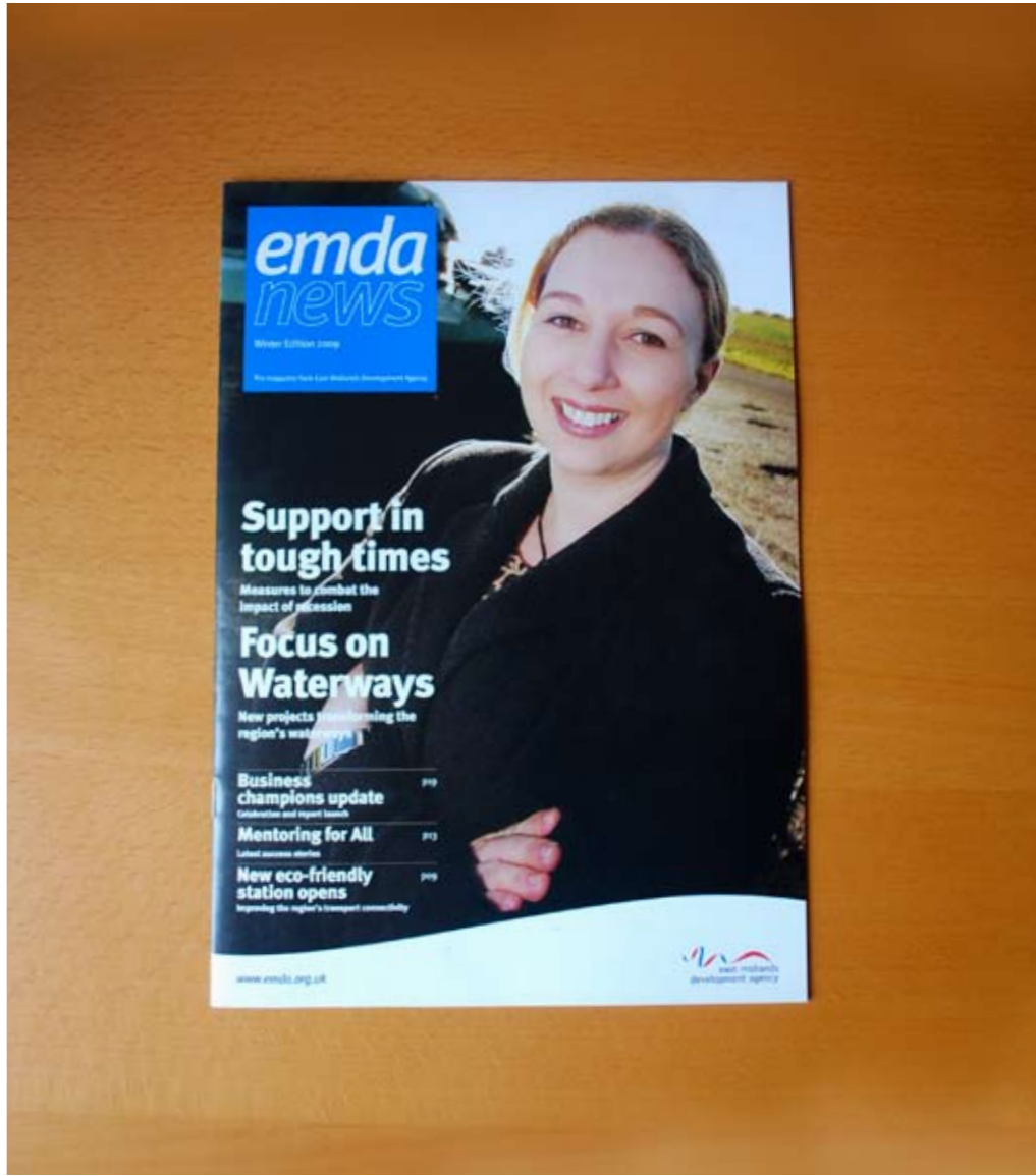
» Right / newsletter design

Attitude Design has worked with Nellie PR to produce several newsletters for emda. We worked on developing an existing design and artworked the copy and images provided. Attention to detail and the ability to work to strict deadlines was required for this project.