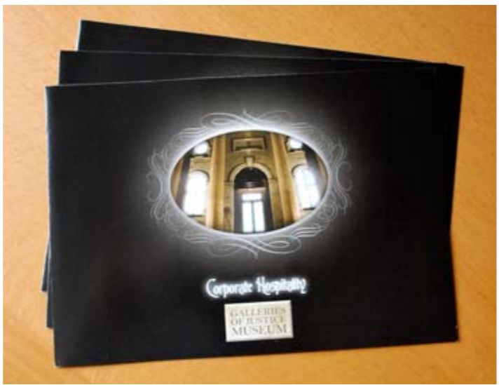
» Right / corporate hospitality leaflet design

Case Information Client: The Galleries of Justice Museum Industry: Tourism Work Completed: ■ Logo & brand identity ■ Website design ■ Print design ■ Banner Design