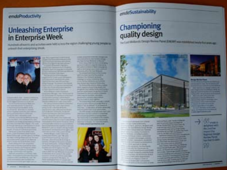
« Left / newsletter design