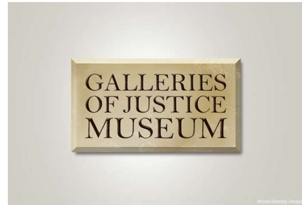
Brand Identity Design

A modern and appealing website design was also developed which is consistent with the museum's new brand image. The construction of the website by the Attitude Design team to enables the museum staff to edit and update the site themselves.